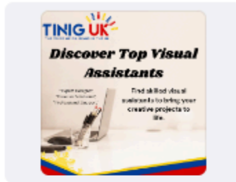
Business Directory VA Graphi... Album Cover