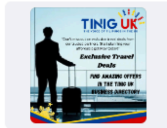
Business Directory Travel Gra... Album Cover