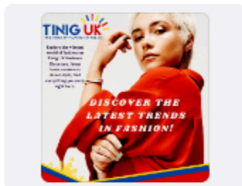
Business Director Fashion Gr... Album Cover