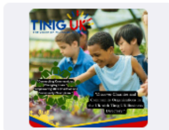
Business Directory Charity Gr... Album Cover