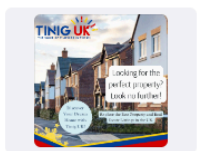
Business Directory Property ... Album Cover