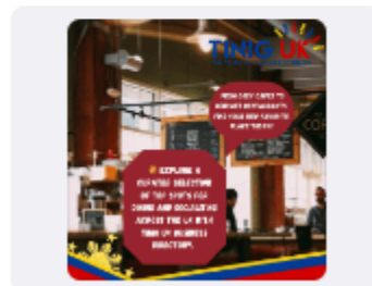
Business Directory Cafes an... Album Cover