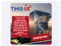
Business Directory Ar... Album Cover