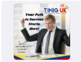
Business Directory Training G... Album Cover