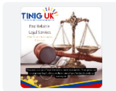
Business Directory Legal Ser... Album Cover